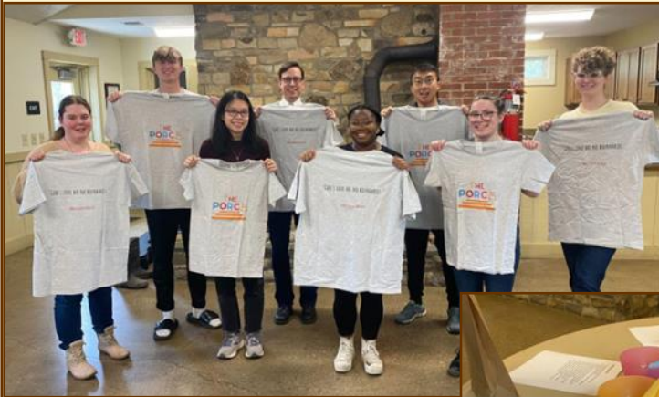
Above: Retreat Participants

The mission of our ministry is to connect students to the life and love of God through fellowship, discipleship, and social justice. At the core, the ministry seeks to serve as a platform for people of all backgrounds and identities to explore or reintroduce themselves to Christianity.