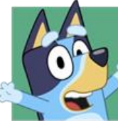
Accepted Romans 15:7