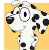
Beautiful Ecclesiastes 3:11