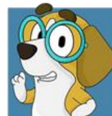
Kind Luke 6:27