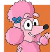
Redeemed Galatians 3:13