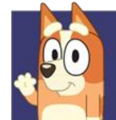
Protected 2 Thess 3:3