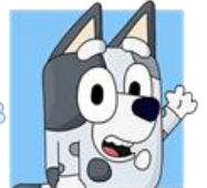
Bold I John 5:14