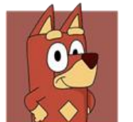
Courageous Deuteronomy 31:6