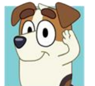
Loyal John 15:13