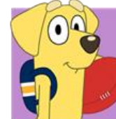
Strong Isaiah 40:13